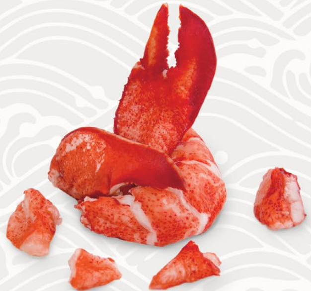
Tail, Claw & Knuckle (TCK)