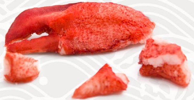
Claw & Knuckle (CK)